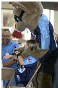
T-Rac having fun with a young fan

The TN Titans entertained a crowd of 150 at the “Join the Team” Community Kickoff Luncheon on May 5 th raising $6,300 for United Way of Bedford County. This was the first year the Titans had incorporated a luncheon into their annual caravan. Four United Ways in TN and AL benefited from Titans luncheons in May.